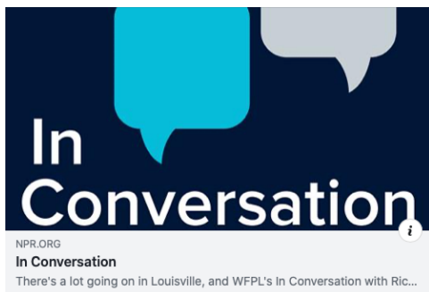
NPR In Conversation 11/22/2019