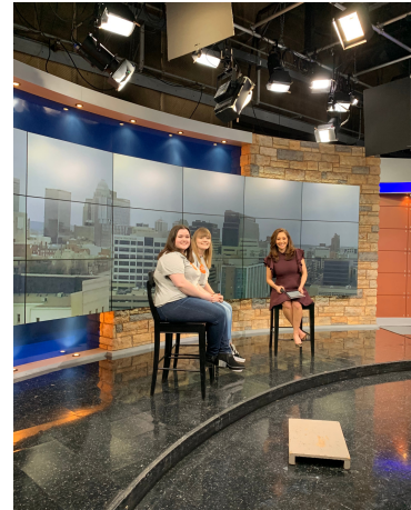
Wave3 News 3/9/2020